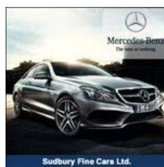
AUTOMOTIVE Sudbury Fine Cars