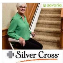
HEALTH & WELLNESS SILVER CROSS - Sudbury